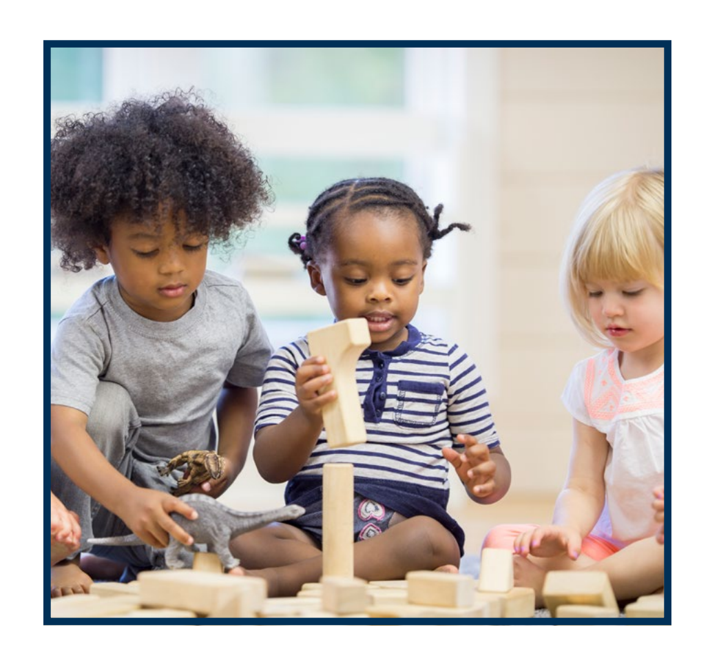
I can build with blocks, legos, and letters.