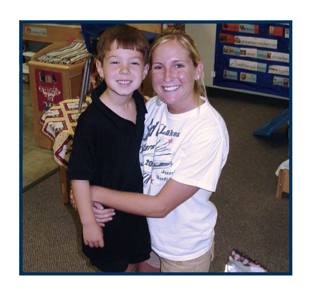
I say "Hi" to my teacher.