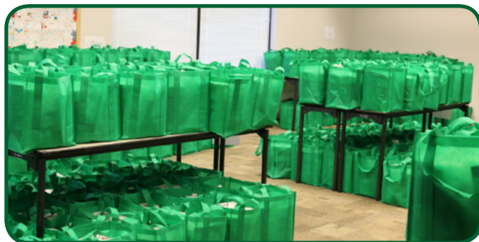
Thank you to First Quality and River Valley Health and Dental Center for making this project a success!