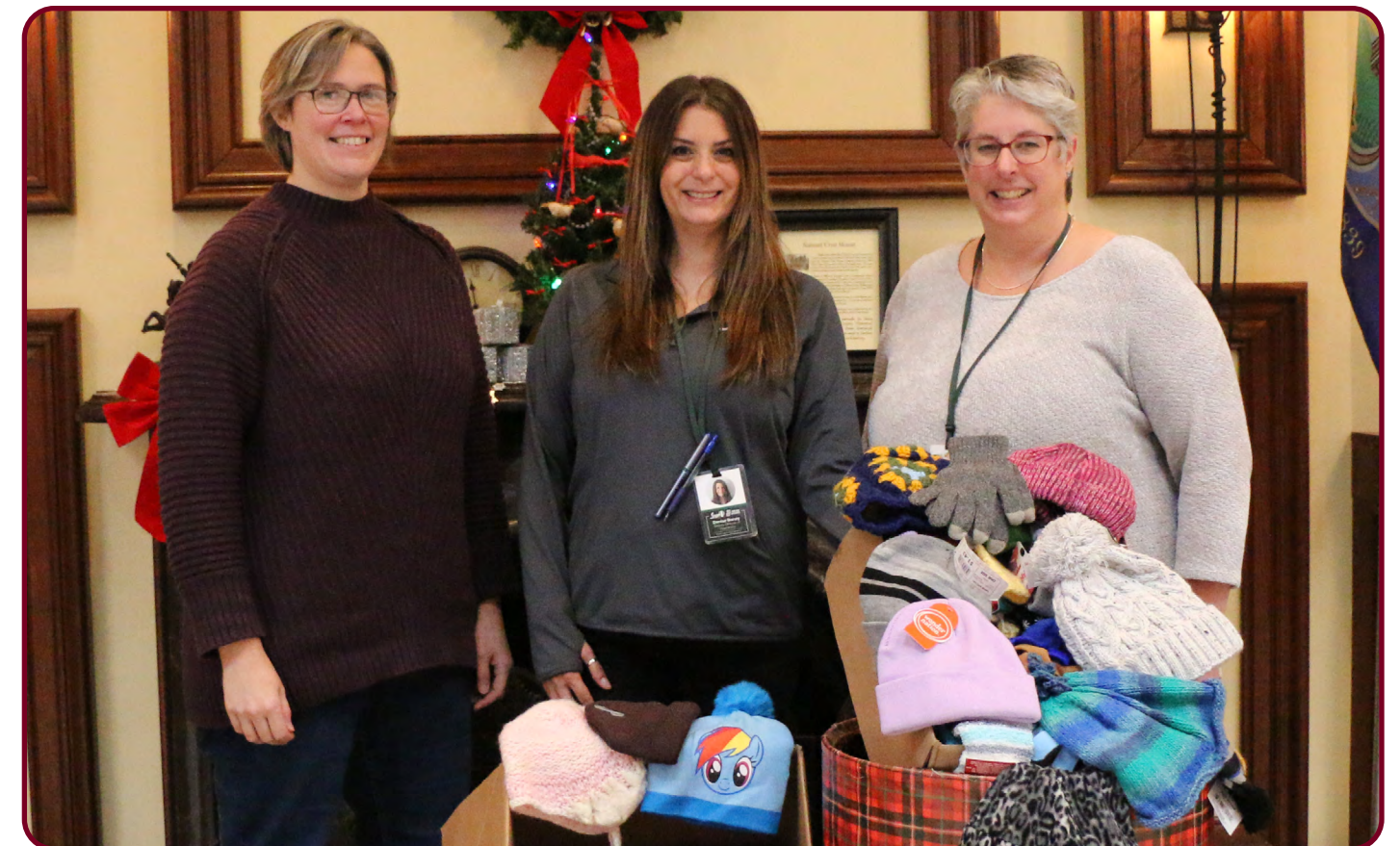
Lock Haven University organized an on-campus Mitten Tree drive and presented their collection of 166 items to the Clinton County Community Center.