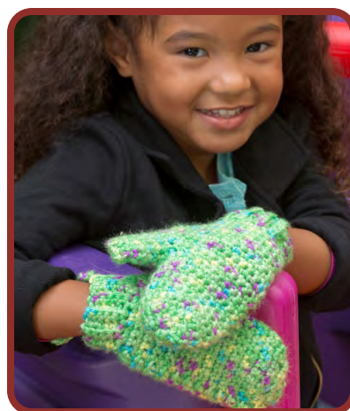
Many of the donated pairs of mittens were handmade by long-time Mitten Tree supporters, Knitters for Neighbors.