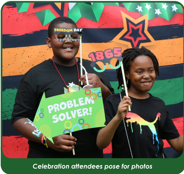
Celebration attendees pose for photos

Williamsport's third annual Juneteenth celebration was held in Brandon Park on Saturday, June 17. The event, hosted by the Lycoming Tri-County NAACP in partnership with STEP, welcomed people from all walks of life to celebrate and recognize Black culture, struggle, and triumph. The day was full of unifying activities that began as a Freedom Walk from Freedom Road Cemetery and ended at Brandon Park, where local businesses and social organizations lined the area around the bandshell.