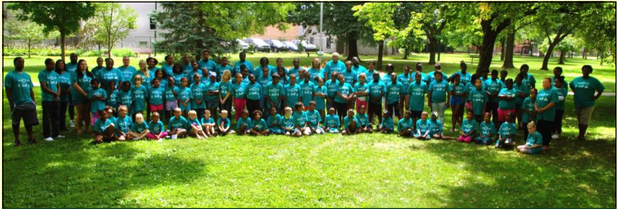
119 youth enrolled in the Summer Counts! Program