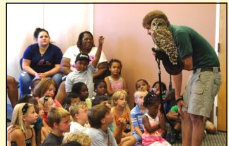
EDUCATIONAL FIELD TRIP