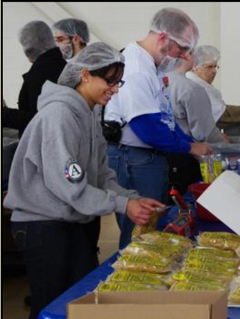
As part of Commemoration Day activities, 150 volunteers and 24 AmeriCorps members prepare 40,000 packaged meals for customers served by local food pantries.

The Martin Luther King Jr. Commemoration Day of Service is a signature AmeriCorps event that celebrates the importance and impact of those who serve the community year-round.