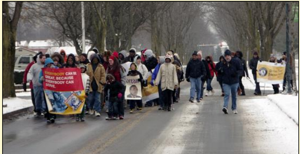
The day begins with a Peace Walk to commemorate the life of Dr. Martin Luther King Jr., who was a strong proponent of volunteerism.